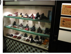
footwear, shoe shop