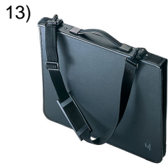
purse, pocket-book, portfolio